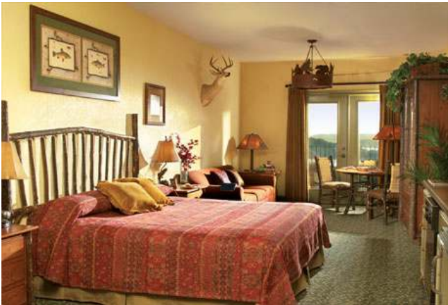
Studio apartment (w/ partial kitchen)