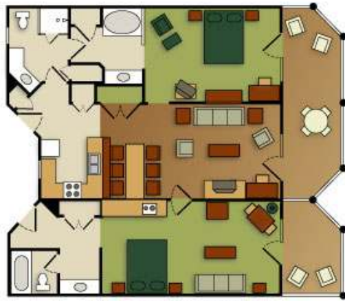
Lodge - 2 Bedroom 1,350 SQ FT