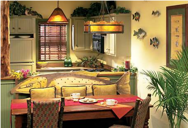
1 Bedroom Dining/Full Kitchen