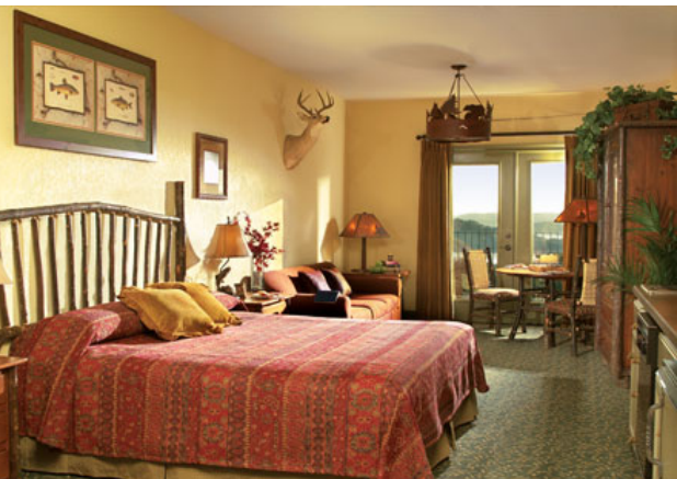
Attached studio apartment (w/ partial kitchen)

For more: https://www.bluegreenvacations.com/resorts/missouri/wilderness-club-big-cedar