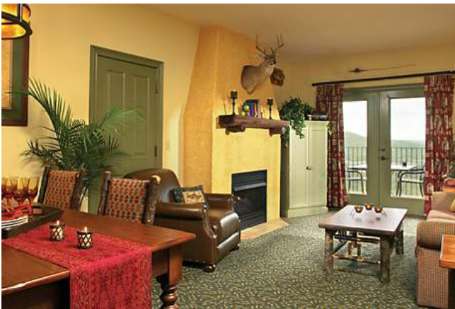
1 Bedroom Living Room